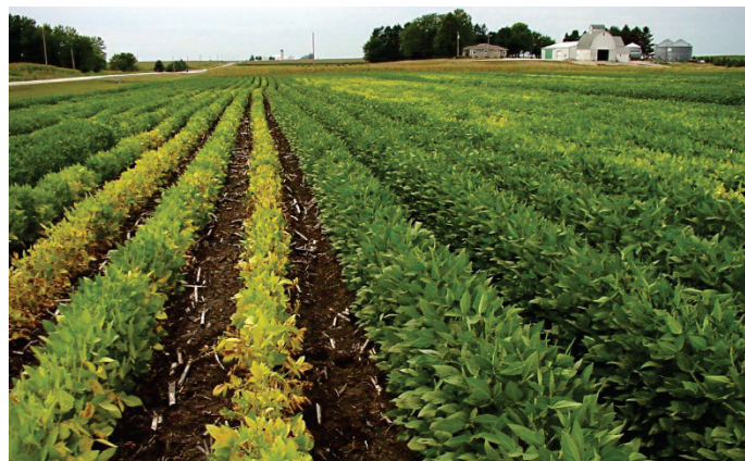
Figure 2. Strips of SCN-resistant and non-resistant soybean varieties in a SCN-infested field, showing damage to the non-resistant varieties.