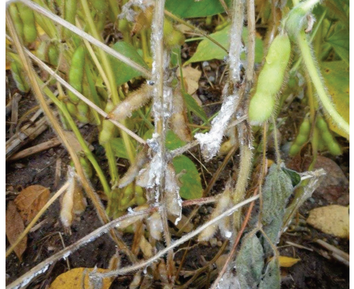
Figure 2. White mold development on soybean, formation of sclerotia.