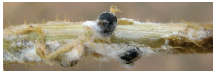
Figure 3. White mold sclerotia on outside of soybean stems among moldy tissue, appearance is more rounded.