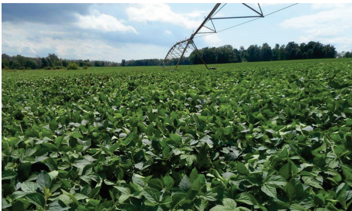
Figure 5. High density canopies with cool and moist conditions favor disease development.