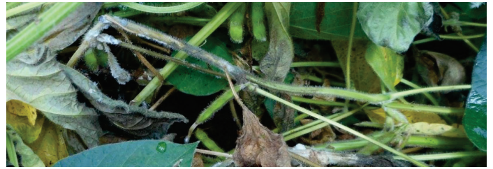
Figure 6. Soybeans that have lodged due to loss of structural integrity as a result of white mold infection.