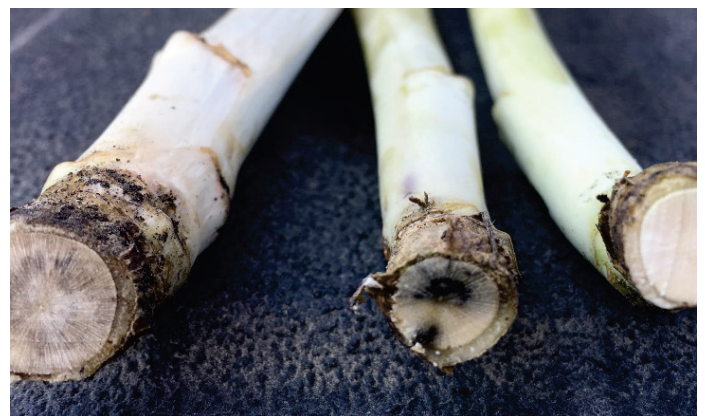
Root cross-section of plants prior to harvest. Verticillium stripe (left), blackleg (middle), and healthy plant (right).