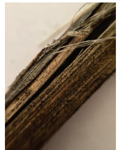
Peeling epidermis to reveal microsclerotia