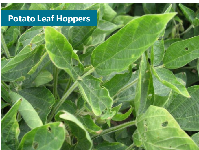
Potato Leaf Hoppers