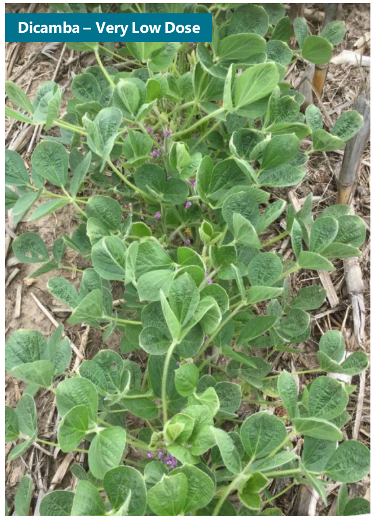
Figure 3. Soybean plants in a field near Waterville, KS showing symptoms of exposure to a low dose of dicamba. Left: Plants showing leaf crinkling, upward leaf cupping, and whitish leaf margins on new growth characteristic of dicamba injury. Right: Symptoms of a very low dose of dicamba exposure, including crinkling at the leaf tips and slight downward cupping.