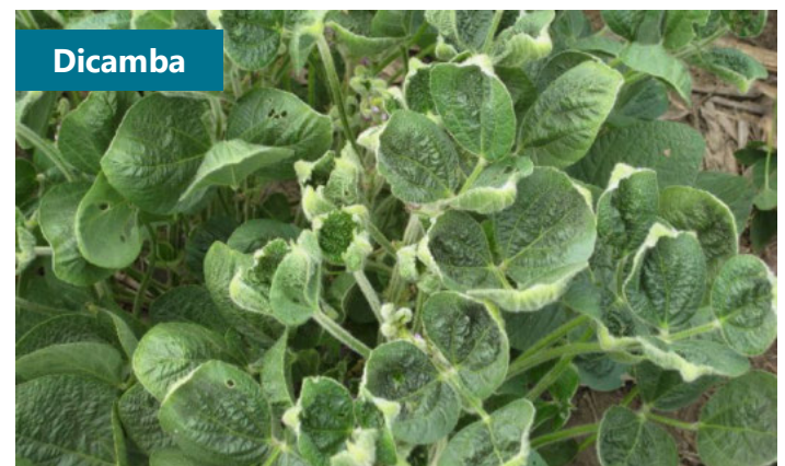
Figure 2. Soybean plants showing upward leaf cupping characteristic of dicamba injury. Symptoms are limited to newer growth, with older leaves unaffected.