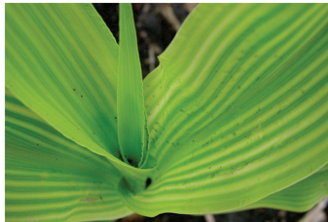
Yellowing between leaf veins is a symptom of sulfur deficiency in corn.

Sulfur fertility has historically not been a major concern for growers on most soils, as soil organic matter, atmospheric deposition, manure application and incidental sulfur contained in fertilizers have typically supplied sufficient sulfur for crop production. However, reductions in the amount of sulfur contributed by these factors combined with increased sulfur removal with greater crop yields have made sulfur deficiencies more common.