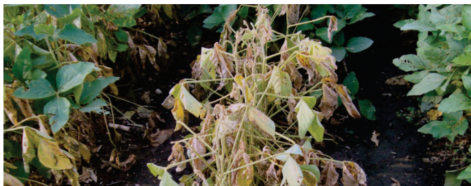
Figure 11. Soybean plants wilted due to Phytophthora rot.