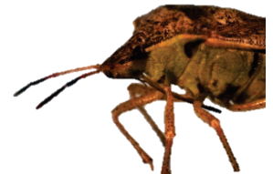
Figure 5. Brown stink bug showing piercing-sucking mouthparts below head and between legs.