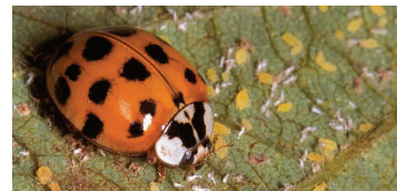
Figure 3. Ladybird beetle preying on aphids.