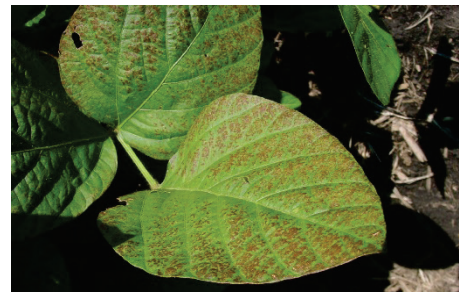
Figure 12. Bronzing on leaves due to Cercospora .