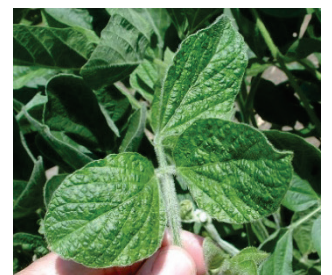
Figure 15. Soybean leaf with symptoms of bean mottle virus.