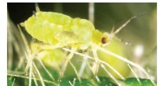
Figure 4. Close up of soybean aphid.