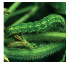
Figure 6. Soybean podworm feeding on soybean.