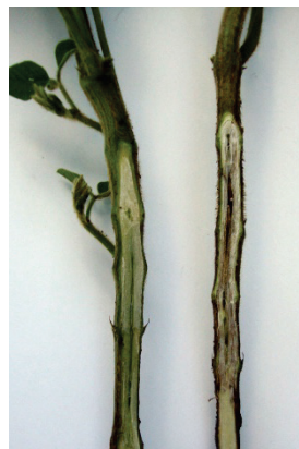
Figure 10. Phytophthora infected soybean on right, compared to a healthy soybean on the left. Note the dark brown lesion.