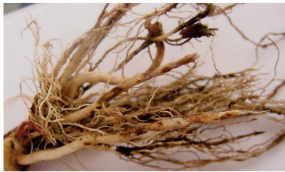
Figure 8. Cankers in roots due to rhizoctonia root rot