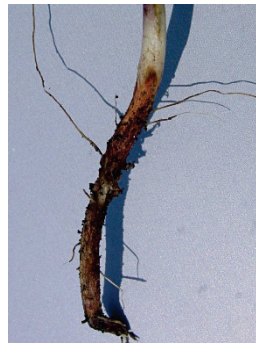
Figure 7. Red discoloration at soil line due to Rhizoctonia solani .