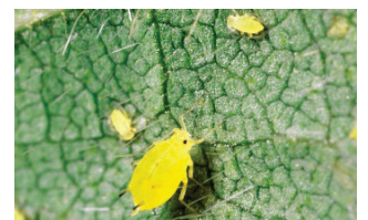
Figure 16. Aphid feeding on soybean leaf.