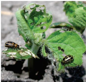
Figure 1. Bean leaf beetles feeding on soybean, can vector bean mottle virus.