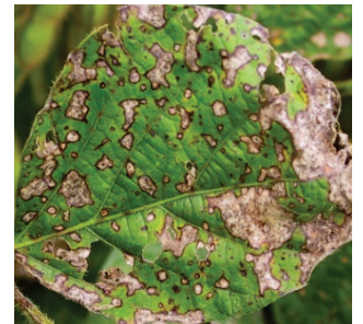
Figure 14. Frogeye leaf spot on soybean.