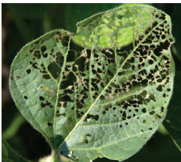
Figure 2. Skeletonization of soybean leaf due to Japanese beetle feeding.