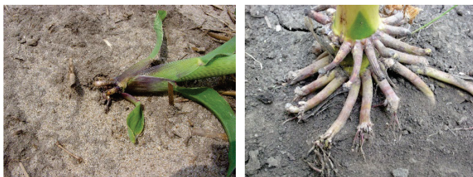
Figure 2. Left: Rootless corn caused by shallow planting followed by dry soil conditions, which inhibited nodal root development. Right: Underdeveloped and callused brace roots resulting from hot, dry conditions during brace root development.