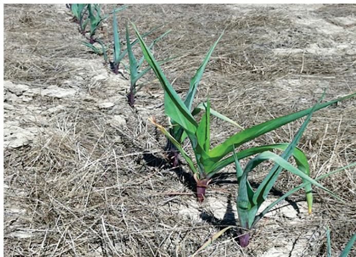
Figure 1. Corn plants at the V3-V4 showing severe stress during the drought of 2012. Drought symptoms at this stage may include leaf rolling, reduced growth, leaf death, and – in severe cases – plant death.