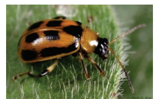
Bean leaf beetle adults